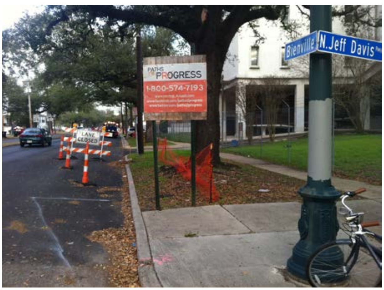
Road work is underway along sections of Bienville Avenue, Banks Street, and Jefferson Davis Parkway in New Orleans as part of the Paths to Progress program.

Road work is currently underway in several parts Meantime, in Kenner crews are at work restorof the metro region as part of the Paths to Prog- ing the section of West Esplanade Avenue beress program.