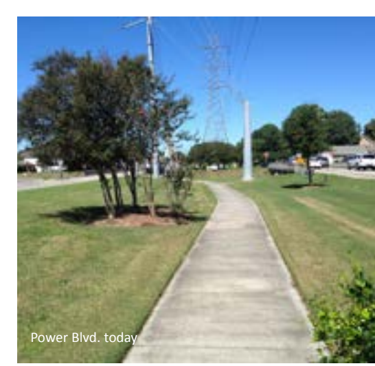
On Power Blvd. (see photos above), plans call for creating a multi-use pathway for bicyclists and pedestrians in the median that includes landscaping and sculptures at certain intersections. This path serves as a connection to the lakefront trail.