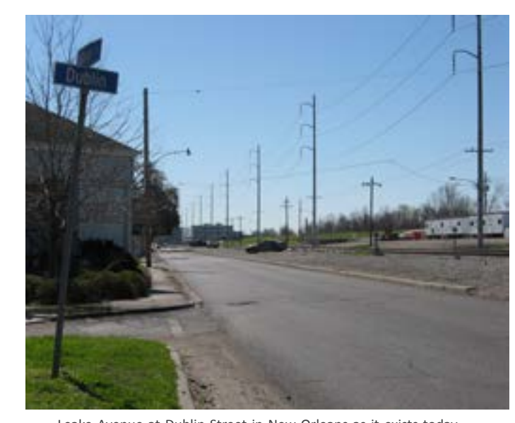
Leake Avenue at Dublin Street in New Orleans as it exists today (above). See rendering on cover for an idea of how it could look under a plan commissioned by RPC.