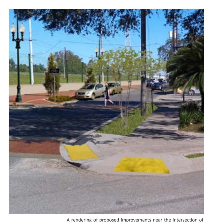
Leake and Carrollton avenues (left) and the intersection as it exists today (right).

The feasibility study is now under review by the Louisiana Department of Transportation and Development.