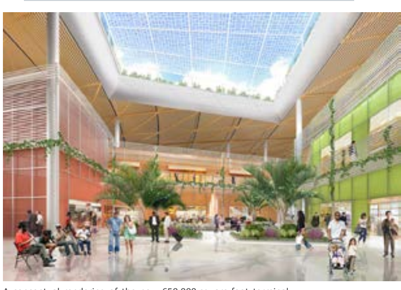
A conceptual rendering of the new 650,000-square-foot terminal complex planned for Louis Armstrong International Airport.

The Regional Planning Commission is in the process of updating the Metropolitan Transportation Plan. This plan, updated every five years, describes the region's transportation needs and the ways we can meet those needs for the next 30 years. It is the chief legal document of the New Orleans Metropolitan Planning Organization, and it includes the goals, objectives, information, and resources that guide this very important planning process. Public input is critical to the development of the plan, so stay tuned to the RPC website for ways you can get involved in shaping this vital document. For more information, contact Jason Sappington at jsappington@norpc.org.