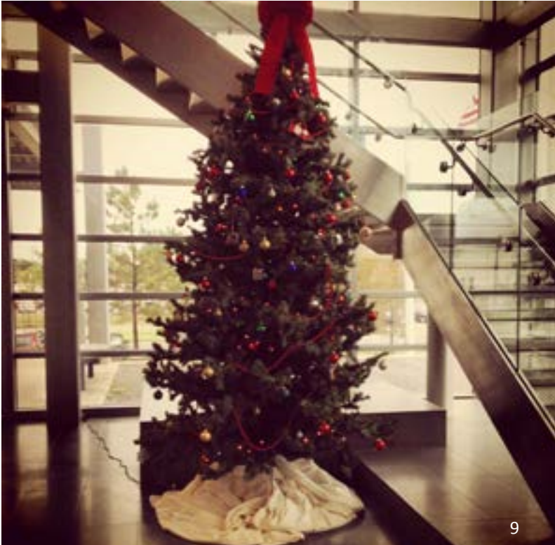
Getting in the spirit